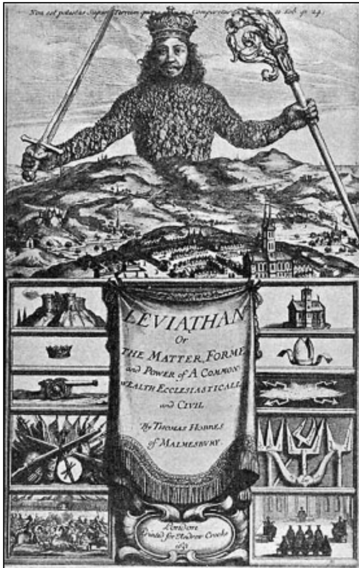
Frontispiece of the Leviathan .

Public domain. From Thomas Macaulay, The History of England (London: Macmillan, 1913).