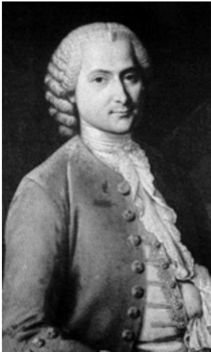
Jean Jacques Rousseau

'To find a form of association which may defend and protect with the whole force of the community the person and property of all its members and by means of which each, coalescing with all, may nevertheless obey only himself, and remain as free as before. Such is the fundamental problem of which the social contract furnishes the solution.'